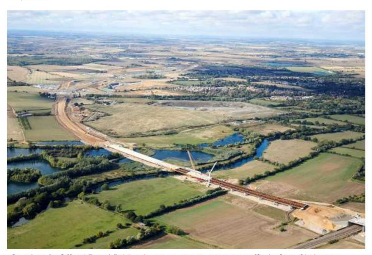
Section 3: Offord Road Bridge is on course to open to traffic before Christmas. Overnight and weekend closures will be necessary in December to prepare the bridge for traffic, including barrier installation and the final surfacing to connect to the existing road, (please see Traffic Management above). Work on Conington Road Bridge will continue in the New Year, with completion expected in the Spring. Earthworks are underway for the last new bridge at New Barns Lane Bridge for which construction will begin in the New Year.

for the first surfacing layers to be applied. All structural works should be finished by end of January 2019, by which time a total of 4,600m<sup>3</sup> of concrete will have been set in place.